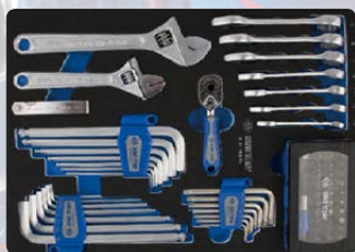
KT9-91190CRV • 90 PCE STUBBY WRENCH & HEX KEY SET in EVA FOAM METRIC