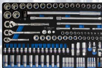
KT9-9003MRV • 103 PCE 1/2", 3/8", 1/4" DR. SOCKET SET 12PT in EVA FOAM METRIC